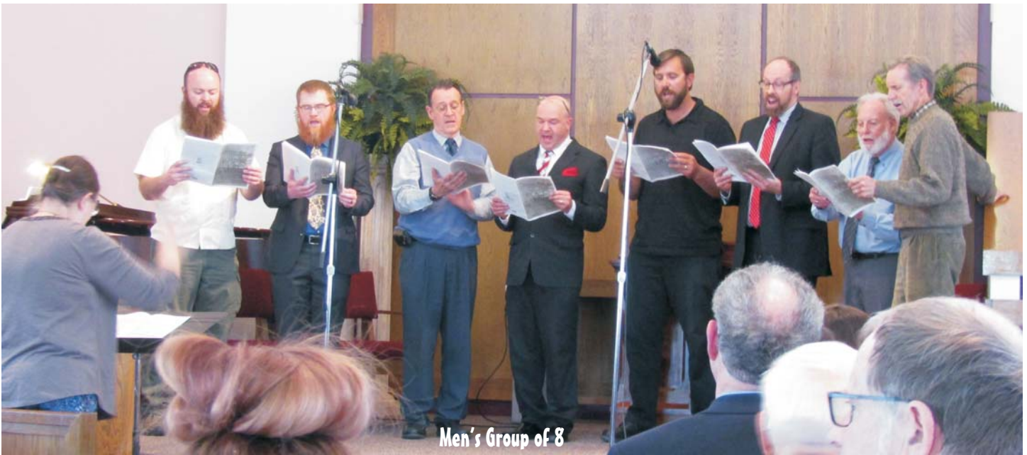
Men's Group of 8

tan's power over us. We must repent. He read 1 Thessalonians 5:1-7. We need to put away our fears and study prophecy... Isaiah. We're paying attention—so He won't come as a thief in the night for us. If we're on a train we want to know where we're going. How can we take the church up to the next level? Everything we heard from our ministry we heard the last few days. The three T's (D.U.H.)!