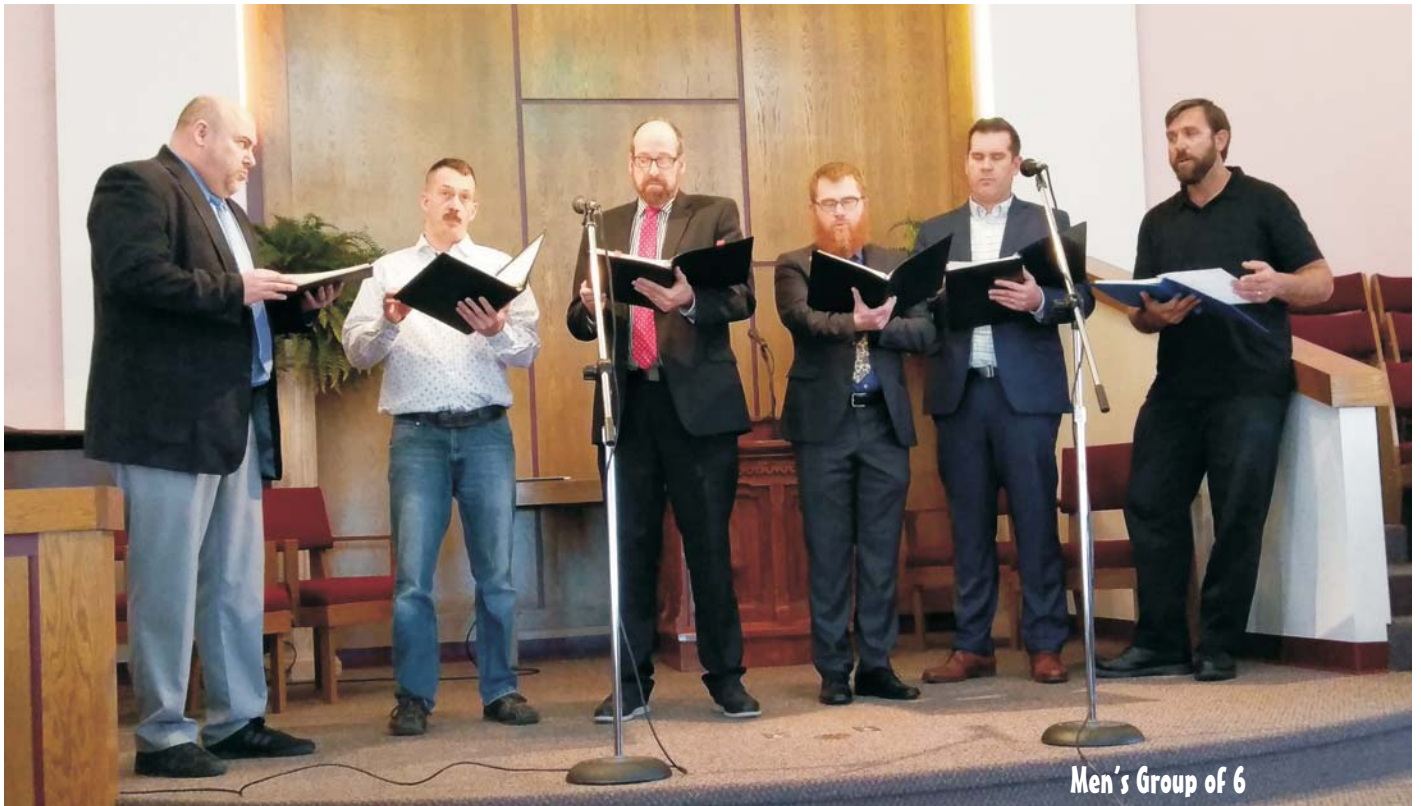
Men's Group of 6

change. We have to be willing to submit to the Lord and allow Him to change us. We desire unity. Trust in the Lord. Let the Lord work with us. Put faith in the Lord—He chooses presidents, leaders and kings. Don't put your own ideas first. He added— We all can trust in God more. . . .