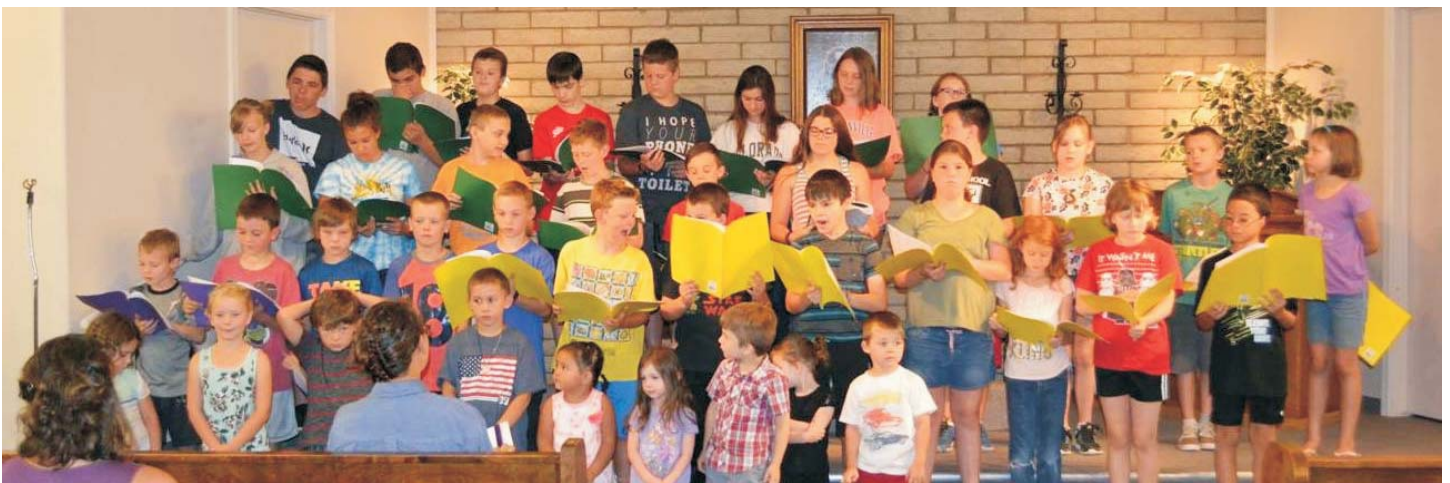
Vacation Church School