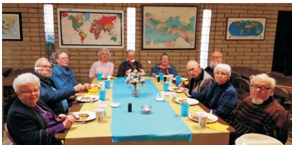
February Senior Supper