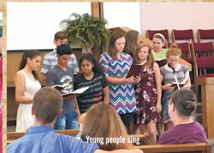
Young people sing