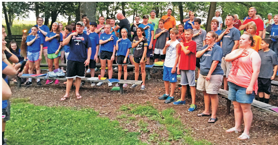
► Campers enjoyed singing some old favorites at the Teen Camp campfires each evening.

Campers and the staff had a great time on the slip-n-slide – an old favorite. One of the activity highlights this year was a vigorously contested cabin challenge that featured everything from cabin members racing as a group walking in unison on 2" by 4" planks to demon-