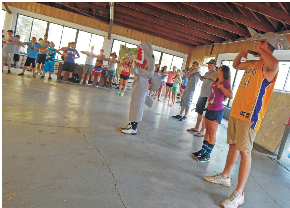
► It came as a surprise to the 2015 campers that a shark was actually quite adept at leading Tuesday morning exercises!