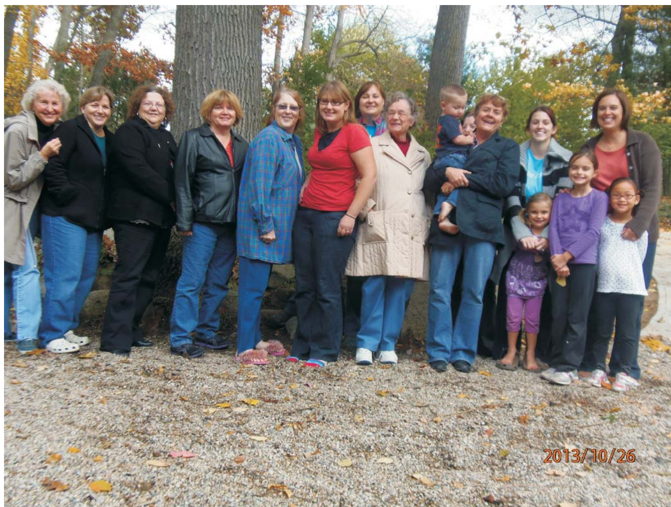
► Women's Retreat — Sleepover