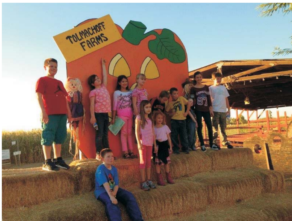
► Tolmachoff Farms