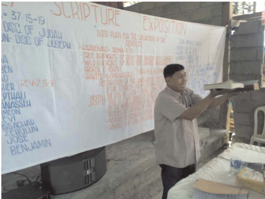
Book of Mormon