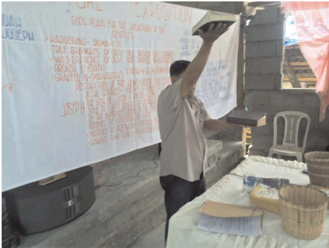
The Bible and the...