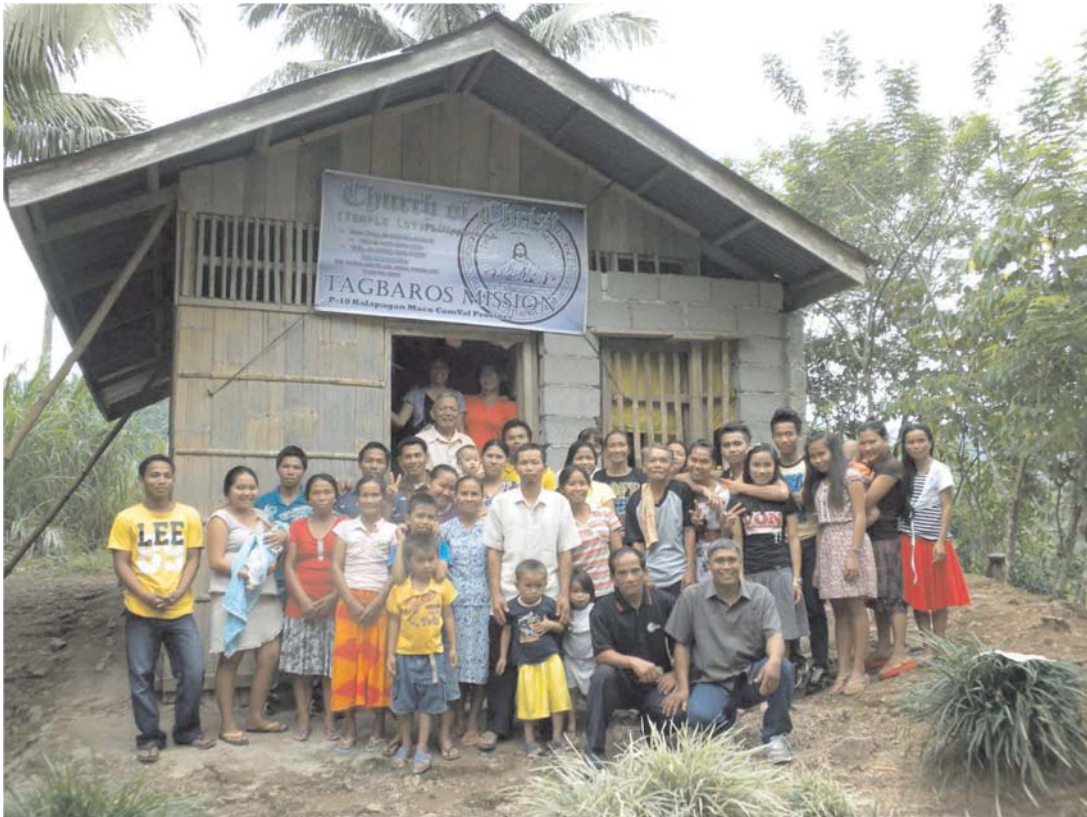
Tagbaros Mission, one of the many missions on the island of Mindanao

“But great are the promises of the Lord unto those who are upon the isles of the sea; Wherefore, as it says isles, there must needs be more than