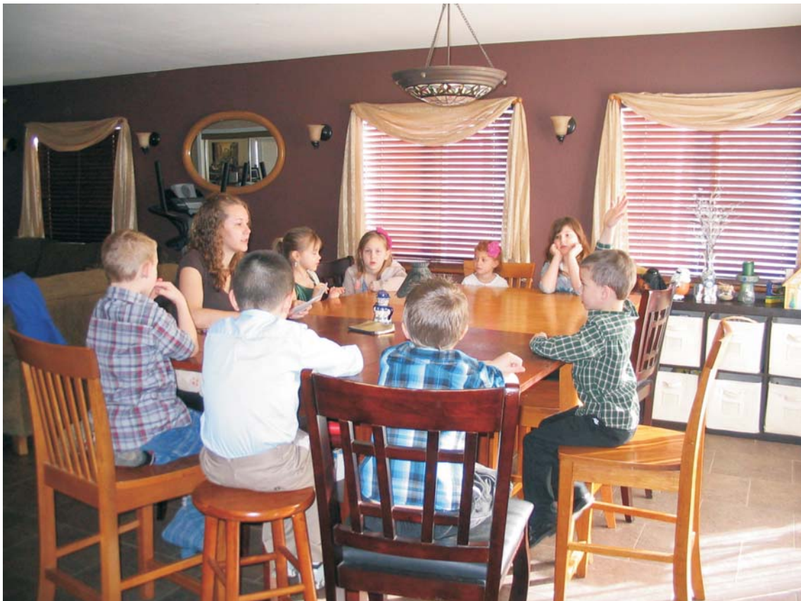
► Sunday School