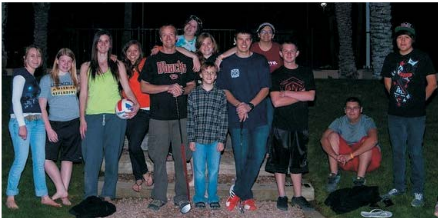
► Teen Camp