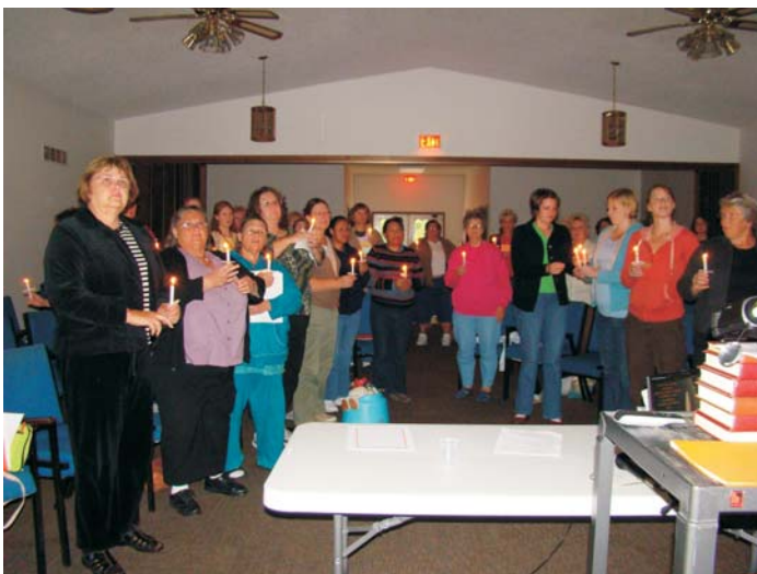
Candlelight song to close Retreat

The retreat will begin officially on Friday, October 1, at 7:30 p.m., but the retreat center is open to us in the afternoon as early as 2:00. The afternoon is free for visiting in the lodge, walking the paths or doing a provided craft. Some also gather for lunch together before going to the campgrounds. After supper, served from 5:00-7:00, the retreat is opened with an icebreaker and a skit and songs to introduce the theme. This year's theme is from Mosiah 1:49: "...When ye are in the service of your fellow beings, ye are only in the service of your God." The rest of Friday evening is relaxed with free