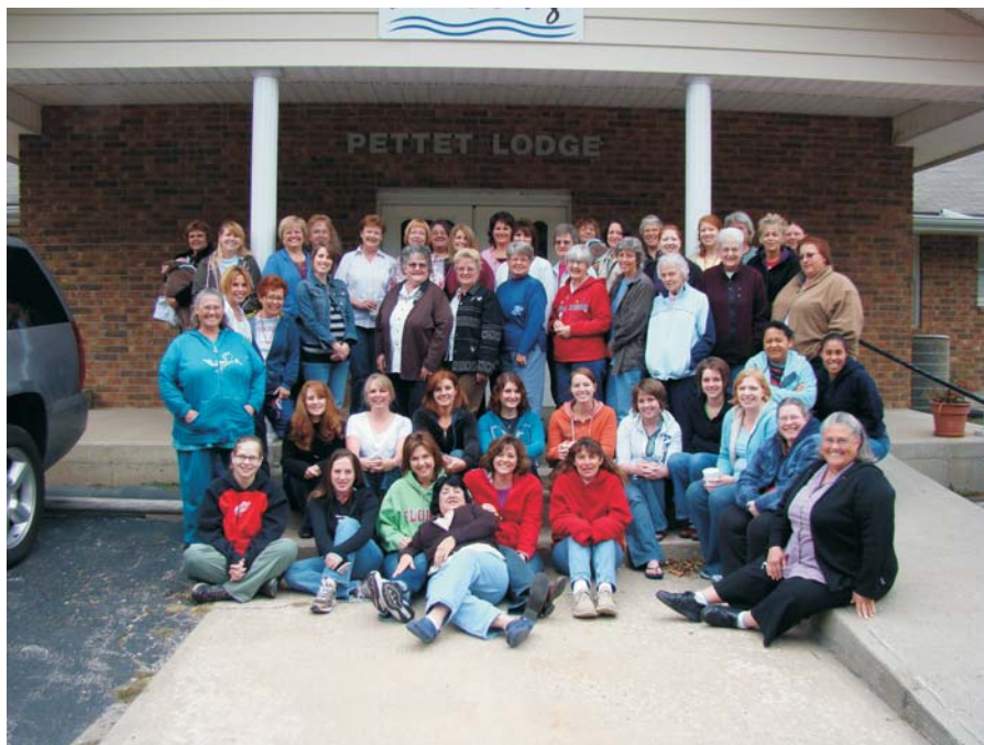
2009 Women's Retreat Group Photo

Church of Christ Women's Retreat's Mission Statement: "To provide an opportunity to learn practical applications of God's word in our lives, so that we may develop a closer walk with the Lord, while strengthening relationships and enjoying fun and fellowship."