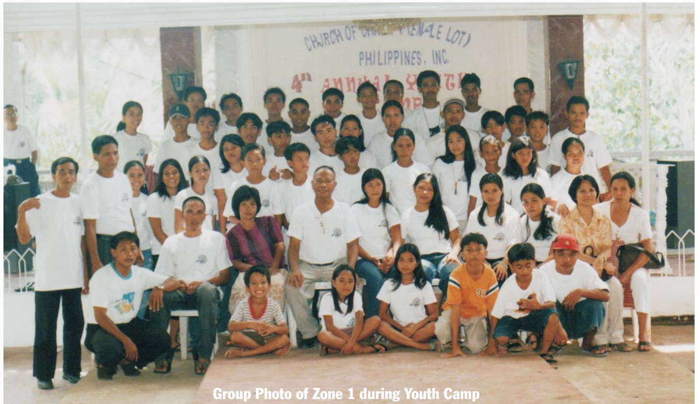
Group Photo of Zone 1 during Youth Camp

to share the knowledge which we learned from them. We thank God for the experience we had while we were there. We know that God has a purpose why we joined this camp. We thank God also for the leaders, pastors, elders and the youth officers for using them as the instruments for the success of the youth camp. To God be the glory.