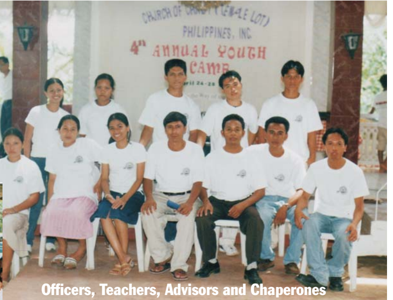
Officers, Teachers, Advisors and Chaperones