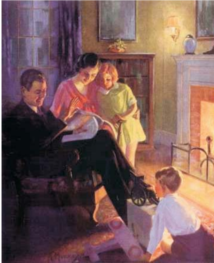
► "Can we begin such by the family coming together on that evening and permitting nothing to interfere with a wholesome communication...?"

Then shall they also answer him, saying, Lord, when saw we thee an hungred, or athirst, or a stranger, or naked, or sick, or in prison, and did not minister unto thee? Then shall he answer them, saying, Verily I say unto you, Inasmuch as ye did it not to one of the least of these, ye did it not to me. And these shall go away into everlasting punishment: but the righteous into life eternal."