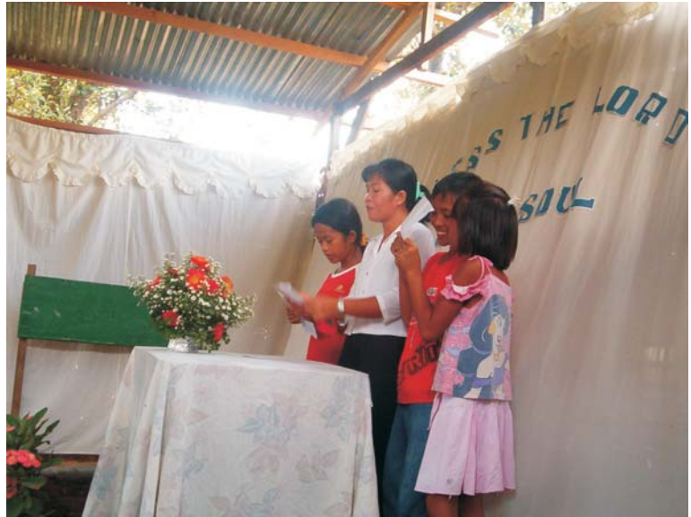
► Song special at the Toril Mission.

The last thing I could make out from the air as we left the Philippines this last October 2005 was a church. Not the Church of Christ, but a church that has its beginning and foun-