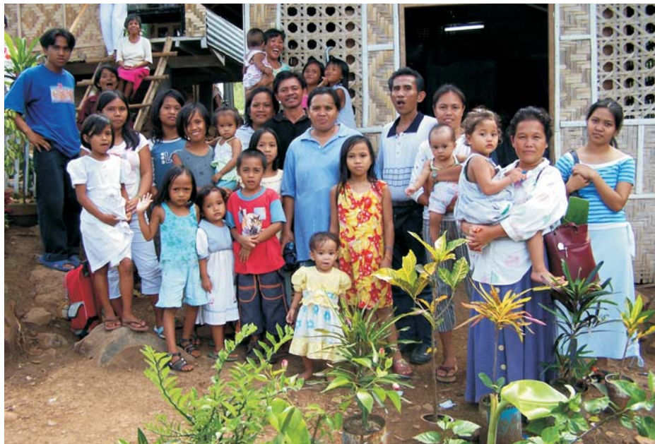
► Church members of Toril.

can standards they are poor; don't worry, I am not offending anyone—they know as well as I that when comparing material wealth, Filipinos in general don't even come close to matching American's wealthy status. The average income for a Filipino is $30 a month...enough said about that. The biggest problem in all of this is that there is so much more to talk about than the fact that our brothers and sisters in the Philippines are poor, yet there is no way to avoid the subject. I am, therefore, stuck between a rock