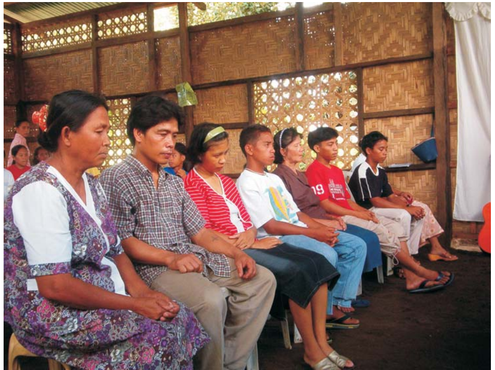
► Baptism class at Toril.