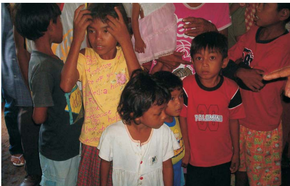
► Some of the children at San Marcos.

had no telephone, no transportation and hundreds of people gathering the next day. All was stopped and other plans put in place, given of the Lord. That next day there was a bombing a mile from our residence. The city of Davao was placed under Marshal Law, and there was another bombing at a