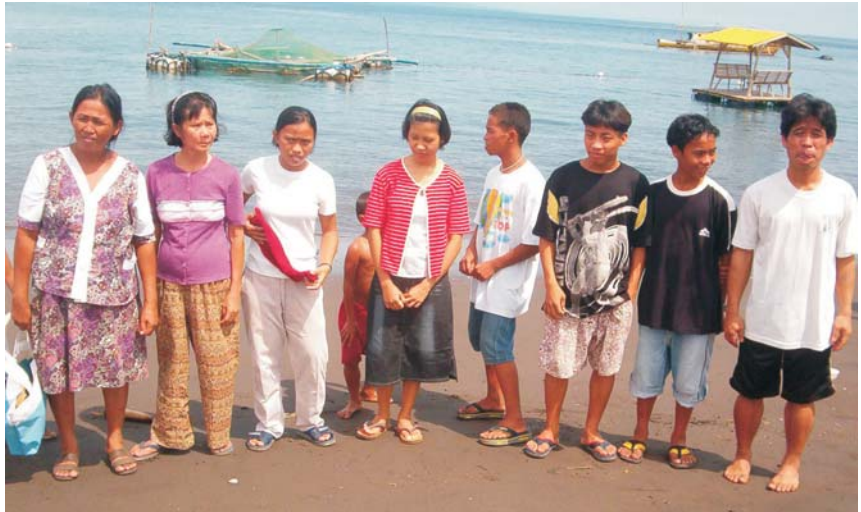
► Baptism at Toril.

They even run schools differently: they don't go from August to May with a summer