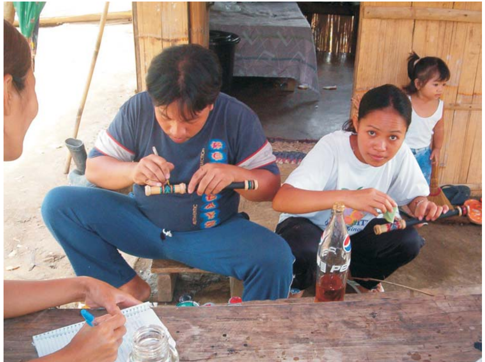
► Making flutes at Luna Sur.

obedience to their request and the Word. He has not been out of bed for a month, and there is no life in his eyes! The next day he arises, bathes and takes a walk. But that is not all—he begins to witness to all he knows and meets of the power of God and his miracle. He lives two more years and then dies; I question and wonder why did he not “live”? He was baptized into the Church of Christ during his “two years” and is alive in Christ! He witnessed and worked for the Lord in his hometown of Tagum, and the Lord’s Work is alive and well there with newly baptized members and regular meetings because of his “two years”!