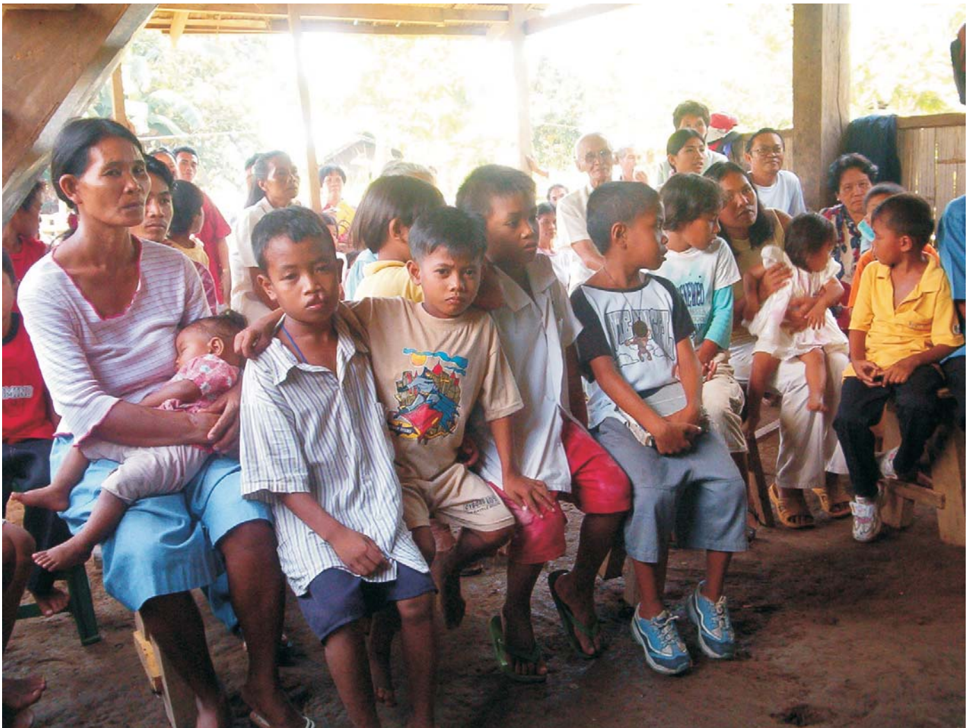
► Part of congregation at San Marcos.