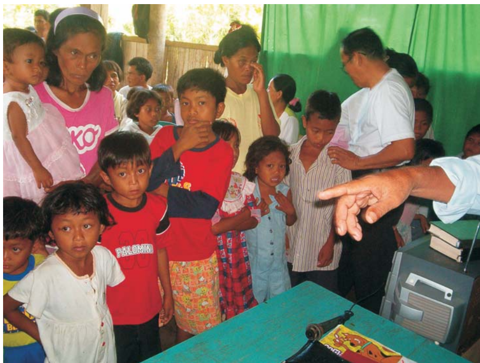
► Getting ready for administration at San Marcos.