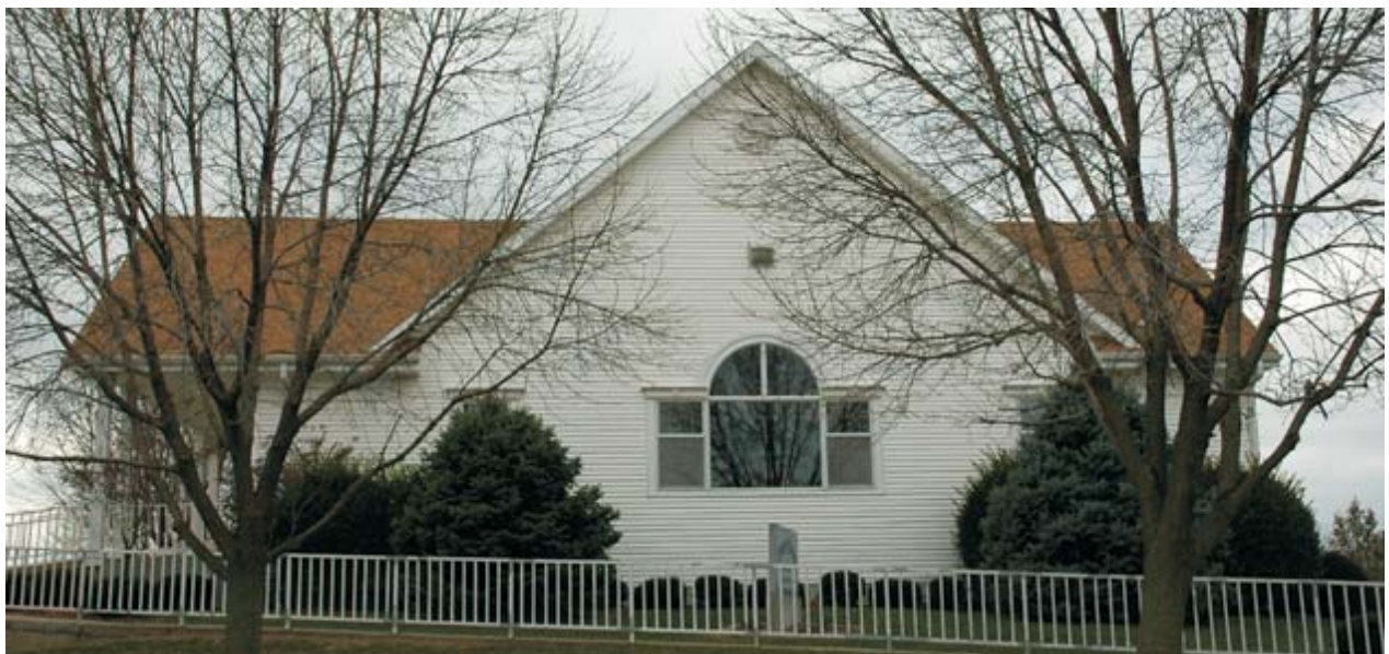
Temple Lot Local, Independence, Missouri