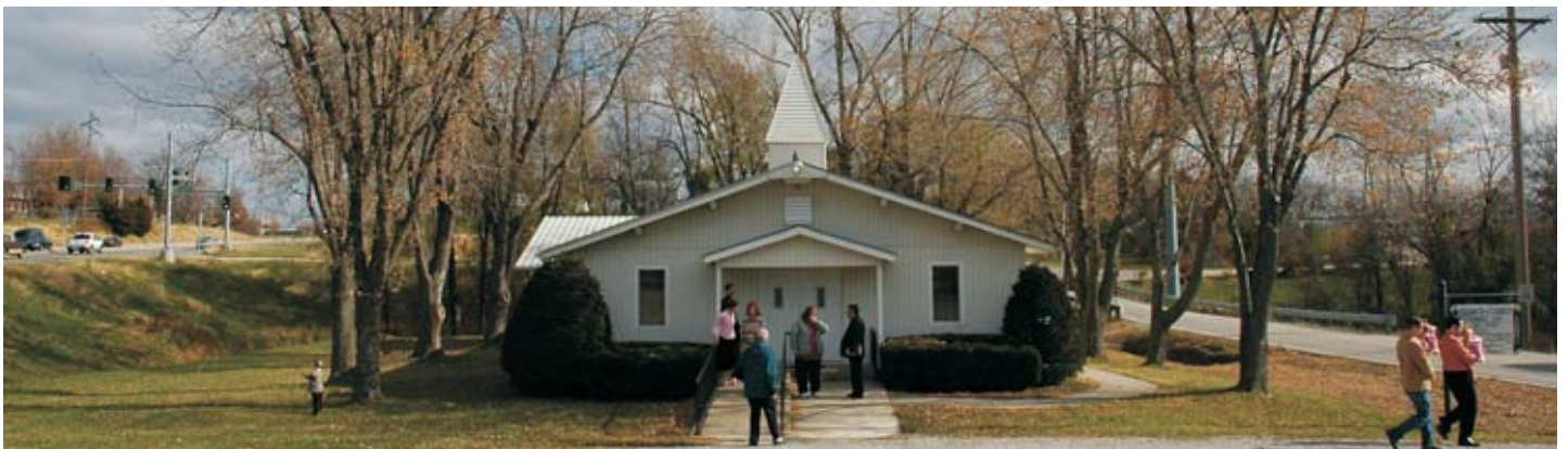
East Independence Local, Independence, Missouri

Once again, we are so thankful to God for all His blessings upon us, and we ask a continued interest in your prayers for those who are in need. We are very thankful for all our brothers and sisters in the Gospel. May God bless each and every one of you.