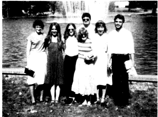
Young people from School of the Ozarks.

Sunday, July 14, found a goodly number in