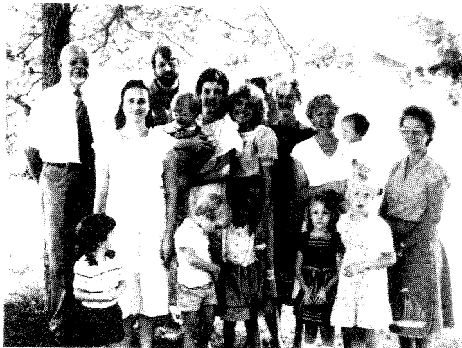
Springfield, (Missouri) Local Church of Christ: Adults, L to R:

We realize we have much to be thankful for —